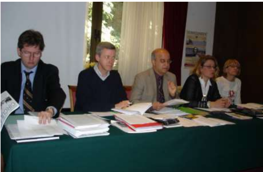
Dubrovnik 2005 – Présidence de l’ Assemblée