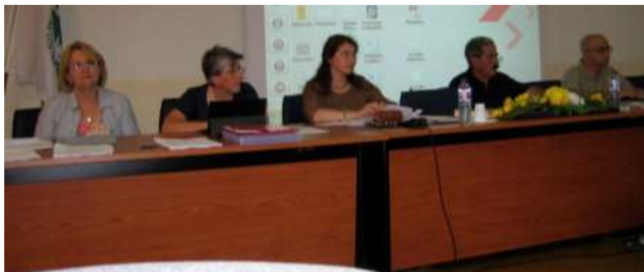
Lisboa 2013 – Presidency of the General Assembly