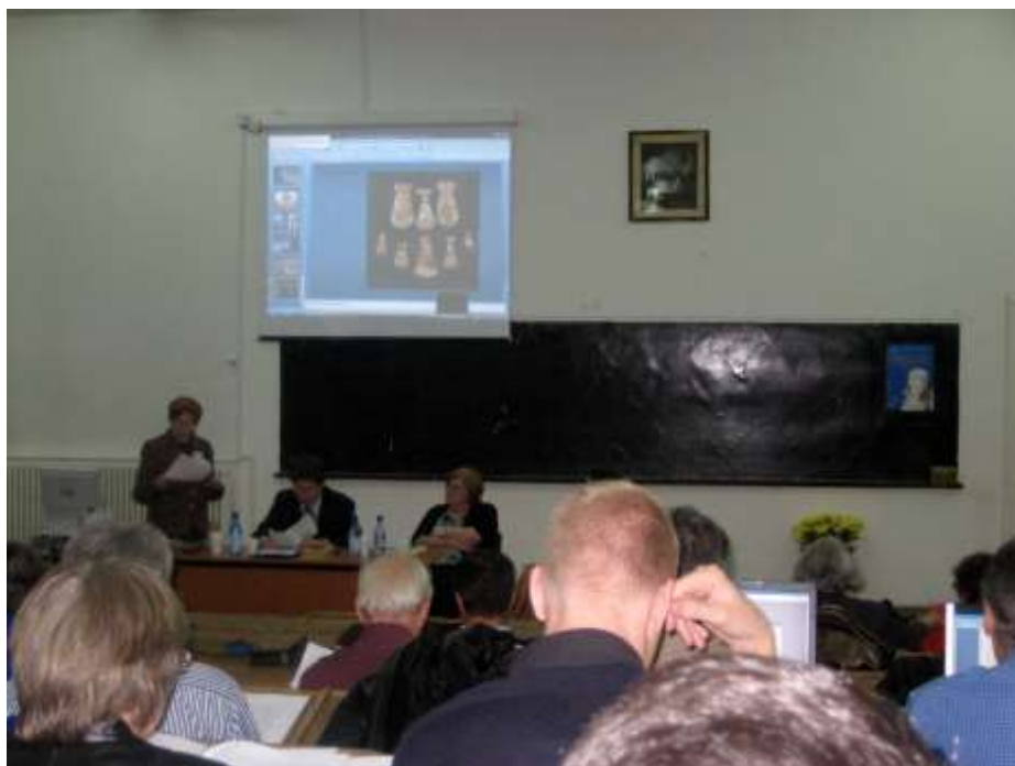
Bucuresti 2008 – Séance de la Réunion annuelle