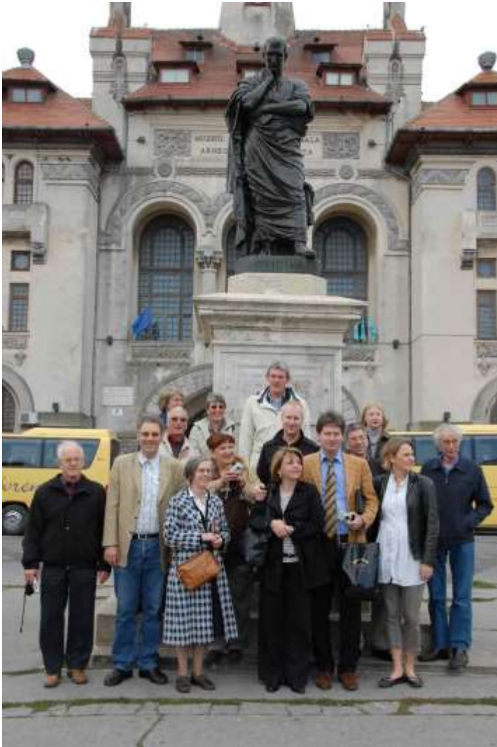
Bucuresti 2008 – Devant le monument d' Ovide

Participants: 21 délégués ou membres des associations nationales d' Autriche (3), de Belgique (3), de Suisse (3), de Danemark (2), d'Espagne (2), d'Allemagne (1), de Croatie (1), des Pays Bas (1), de Macédoine-F.Y.R.O.M. (1), du Portugal (1), du Royaume Uni (1), de Serbie (1) et de Suède (1). Il faut ajouter 44 Roumains (étudiants universitaires et professeurs de tous les niveaux) ainsi que les 9 membres du comité d'organisation.