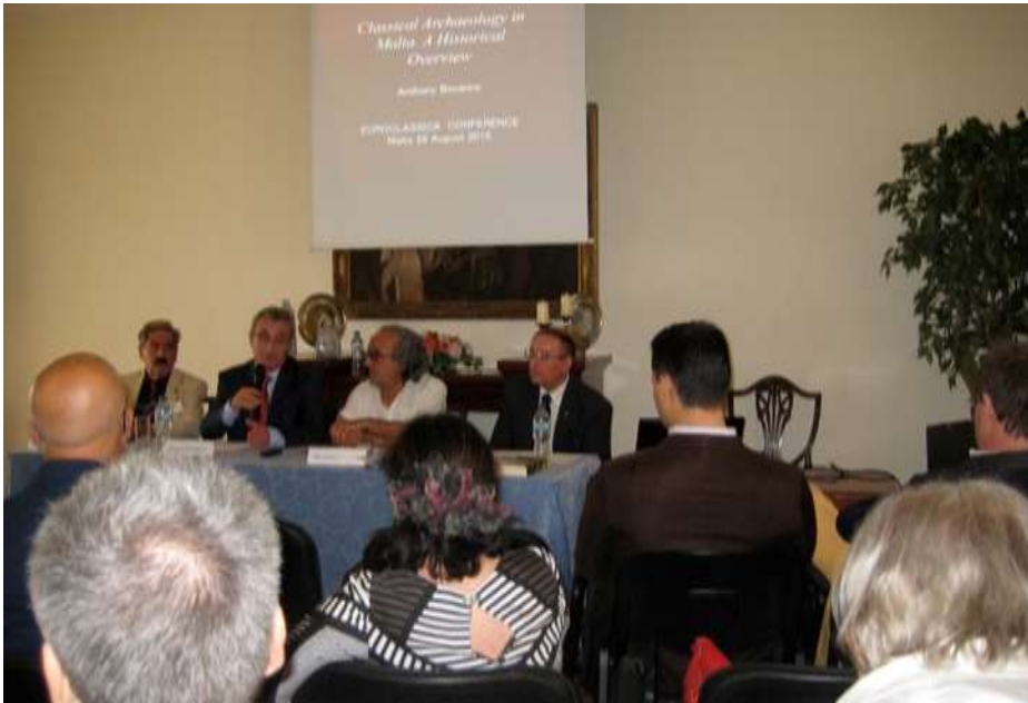
La Valetta 2015 – Session of the Annual Conference