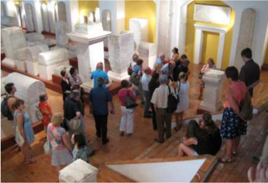
Lisboa 2013 – Visit of the Odrinhas Museum

Participants: 38 representatives or members of the National Societies of Euroclassica, from Belgium (5), Czech (5), Spain (4), Austria (3), Denmark (2), France (2), F.Y.R.O.M. (2), Lithuania (2), Romania (2), Switzerland (2), The Netherlands (2), Croatia (1), Germany (1), Greece (1), Malta (1), Russia (1), Sweden (1), United Kingdom (1), one university teacher of Chili as invited and 11 portuguese more.