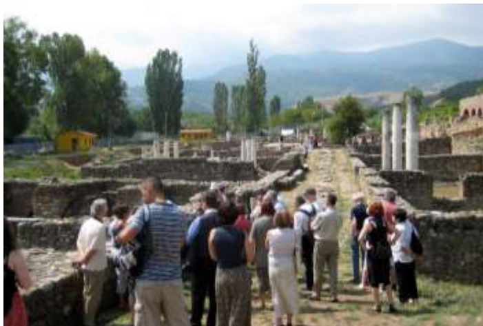
Skopje 2009 – Visit of the archaeological site of Heraclea Lynkestis