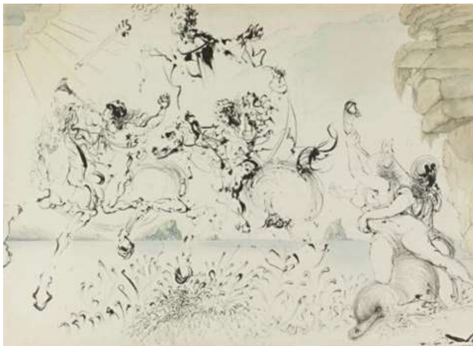
The Rape of Europa by Salvador Dalí (1947)

* number of countries without number of schools or participants: 11, schools (ELEX-V); 1, schools; 6, pupils (ELEX-I), 6, schools (EGEX-V); 2, schools; 2, pupils (EGEX-I).