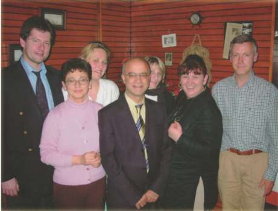
Genova 2004 – Le Comité Exécutif