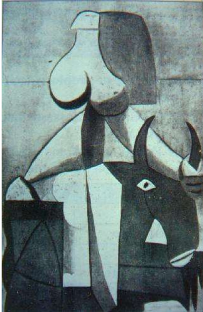
The Rape of Europa by Pablo Picasso