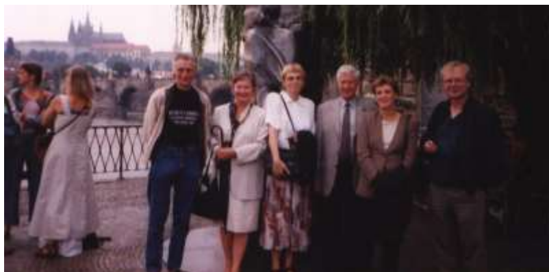
Praha 1999 – Visit of the city