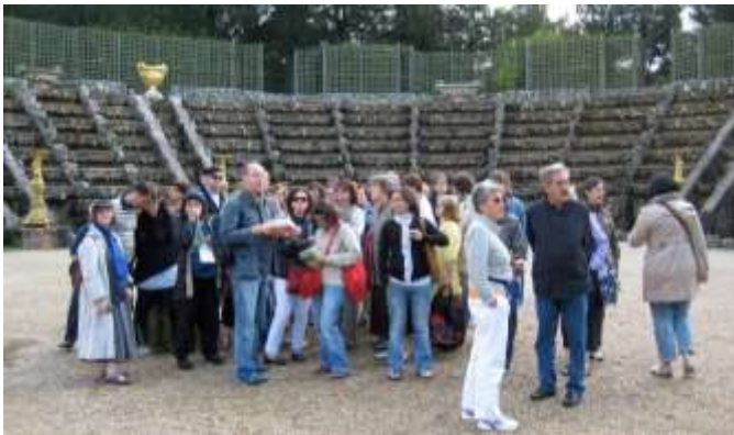
Paris 2011 – Visite du Palais et Jardins de Versailles

Participants: 27 délégués ou membres des associations nationales de Belgique (5), du Danemark (5), d’Allemagne (2), d’Autriche (2), d’Espagne (2), de Suisse (2), de Croatie (1), de la F.Y.R.O.M. (1), des Pays Bas (1), de Lituanie (1), du Portugal (1), de Roumanie (1), de Russie (1), de Suède (1) et de Tchequie (1), et 43 participants français.