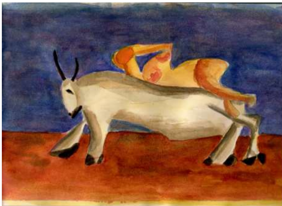
The Rape of Europa (M. López Fuentes)

After fifteen years some changes have occurred in the state of Classics in most countries of Europe. EUROCLASSICA will try to point them out in a forthcoming volume that will be an updated version of the book published in 2006.