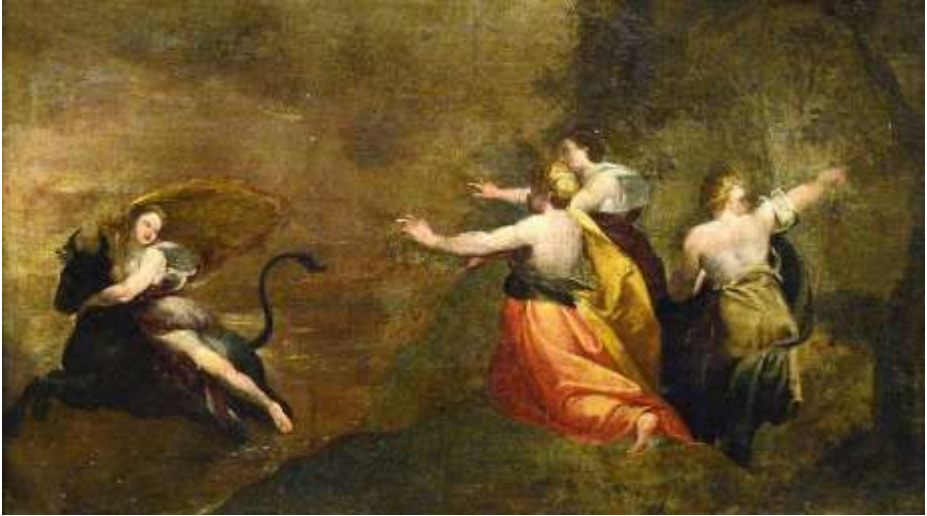
The Rape of Europa by Francisco de Goya