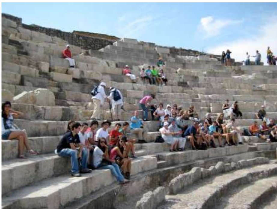
Madrid 2010 – Theater of Segobriga , before the performance of Electra

Participants: 41 representatives or members of the National Societies of Euroclassica, from Spain (8), Belgium (7), Denmark (4), Austria (3), Romania (3), Switzerland (3), Germany (2), United Kingdom (2), Czech (1), Croatia (1), France (1), F.Y.R.O.M. (1), Lithuania (1), The Netherlands (1), Portugal (1), Russia (1), Sweden (1). 4 acompañantes from Austria and other one of Germany made finally the total number of 46.