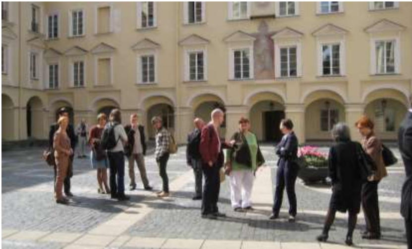
Vilna 2012 – Visit of the University of Vilna