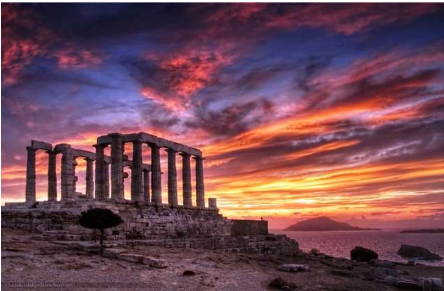
Sunset at Sounion