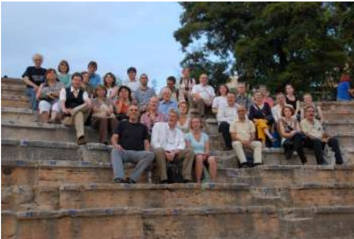
Skopje 2009 – Ancient Theater of Ohrid