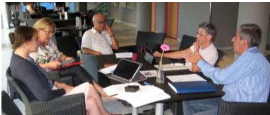
Copenhagen 2014 – The Executive Committee