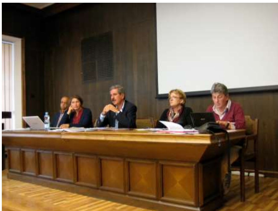
Vilna 2012 – Presidency of the General Assembly